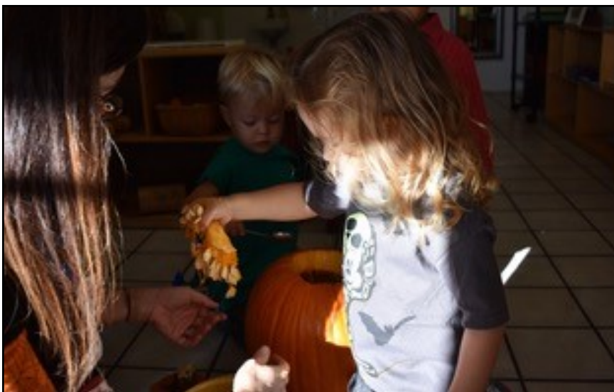
Pulling out our pulp