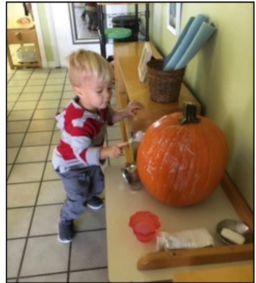
Washing the pumpkin, getting ready for carving.

Never help a child with a task at which he feels he can succeed.