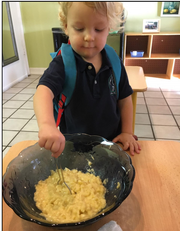
Mashing our bananas for our healthy cookies

Monday, November 26th - Transition Meeting; Nest students moving up to Primary This is a transition meeting to prepare parents and give them insight to their child moving up to the Primary environment. This meeting includes an overview, observation, and time allowed to answer questions. While we prepare your children for future transitions it is also important to communicate information to our parents as each transition for your child is also a transition for our parents.