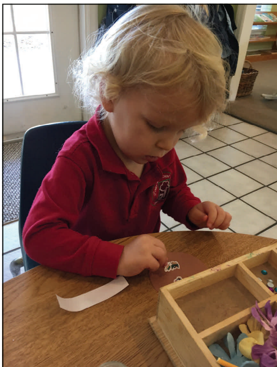
Working with the art box