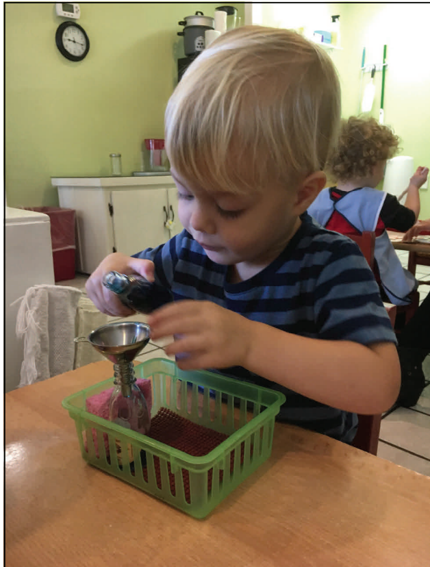
Using a funnel

We cannot create observers by saying 'observe', but by giving them the power and the means for this observation and these means are procured through education of the senses.