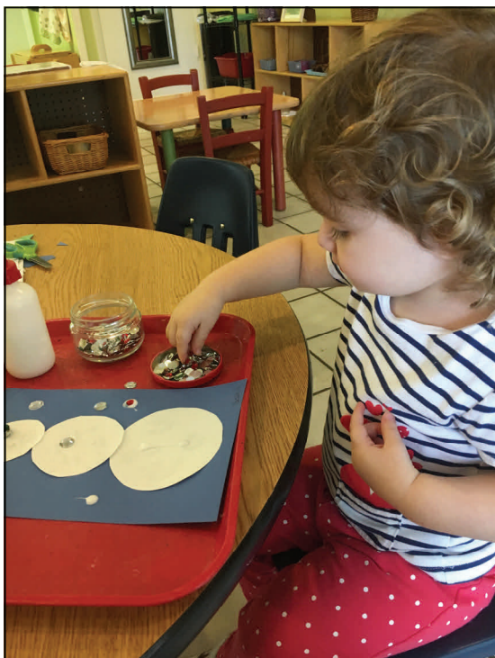
Making a snowman